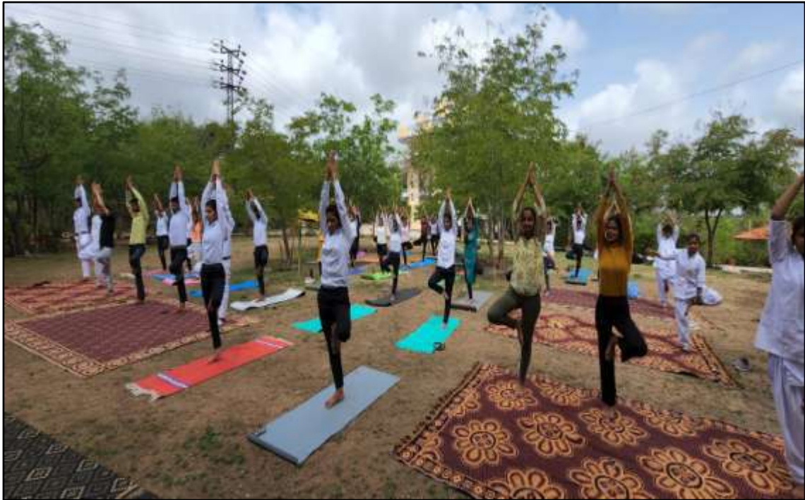
International yoga day was celebrated for a week. During the week different asnas and pranayam was demonstrated to students.