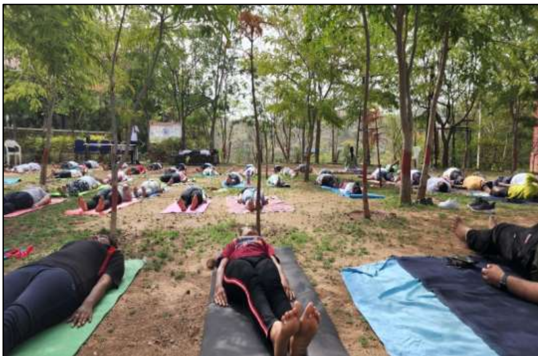
On 21 st June at college campus, all the faculties, non teaching staff and students have performed yoga.