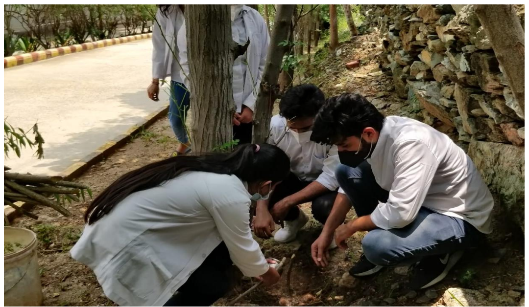
चरक उपवन से पौधे प्राप्त करते हुए